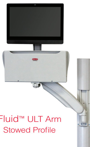
Fluid™ ULT Arm Stowed Profile