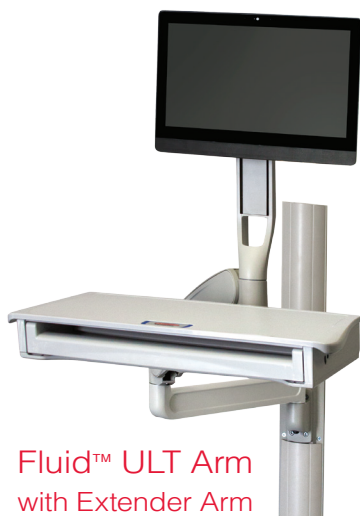
Fluid™ ULT Arm with Extender Arm